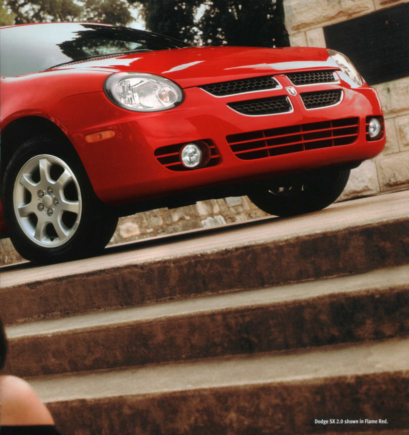
Dodge SX 2.0 shown in Flame Red.