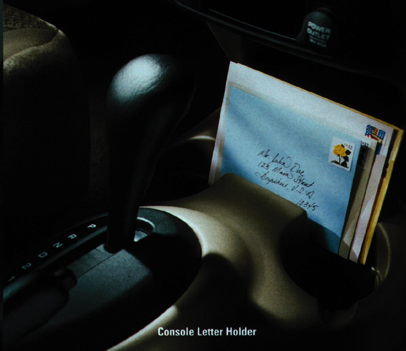
Console Letter Holder