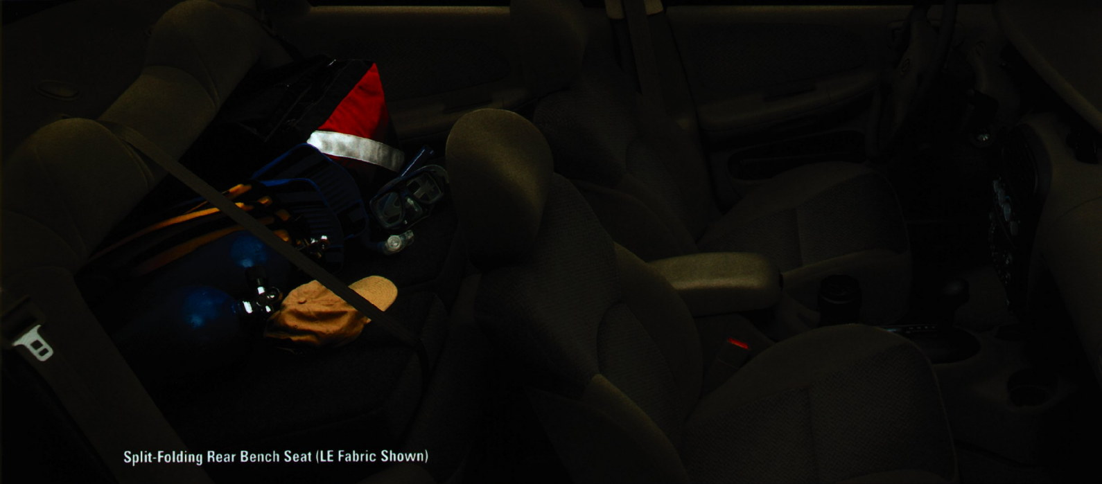
Split-Folding Rear Bench Seat (LE Fabric Shown)