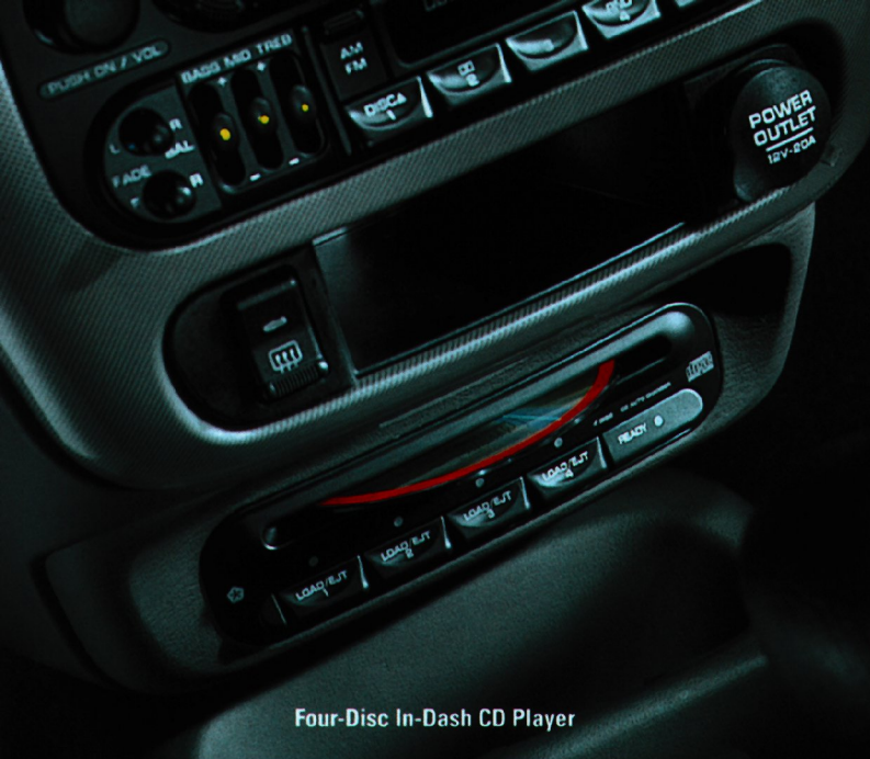
Four-Disc In-Dash CD Player