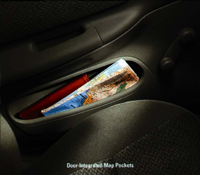
Door-Integrated Map Pockets

There are cup holders that can handle anything from a can of soft drink to really big mugs. Headlamp and turn signal switches are conveniently located on the steering column stalk. There are even the available exterior heated power mirrors that quickly melt away ice and snow. And, as you would expect, the stereo with available in-dash four-disc CD player sounds as good as it looks with two dash-mounted tweeters and four speakers working in harmony to produce exceptional sound quality.