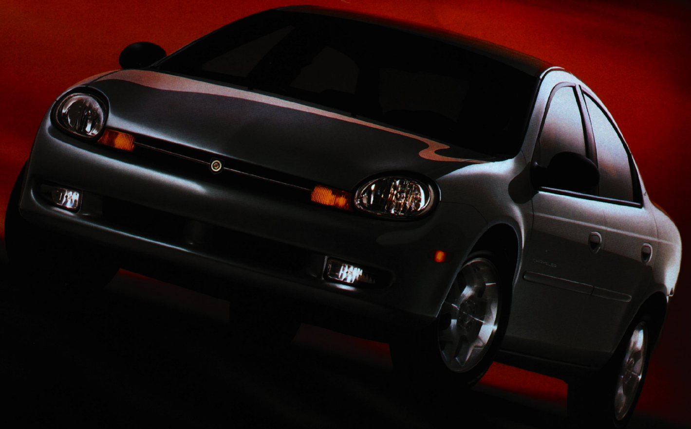
Chrysler Neon LX shown in Bright Silver Metallic.