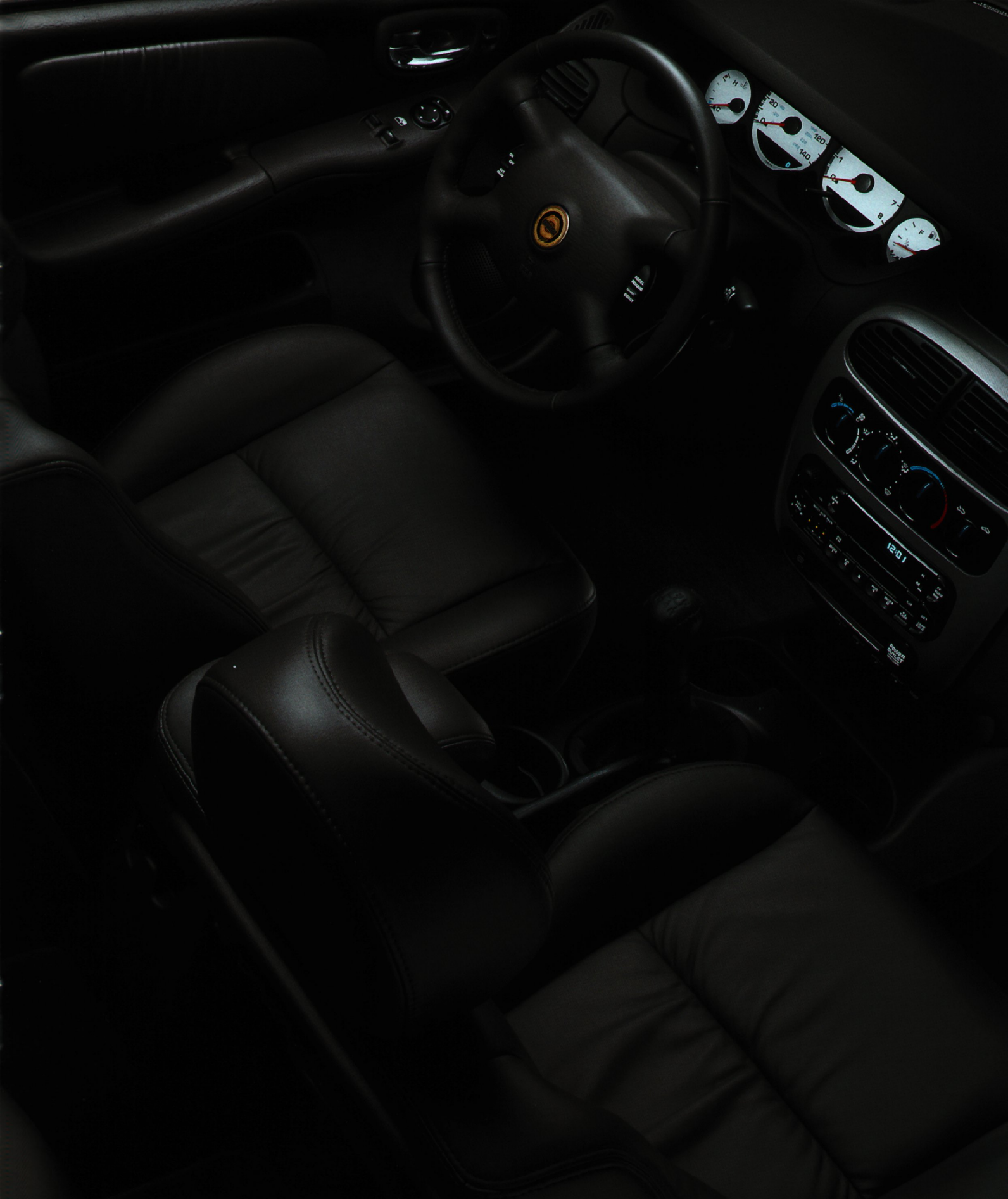
Chrysler Neon R/T interior with leather-faced seating shown in Dark Slate Grey.