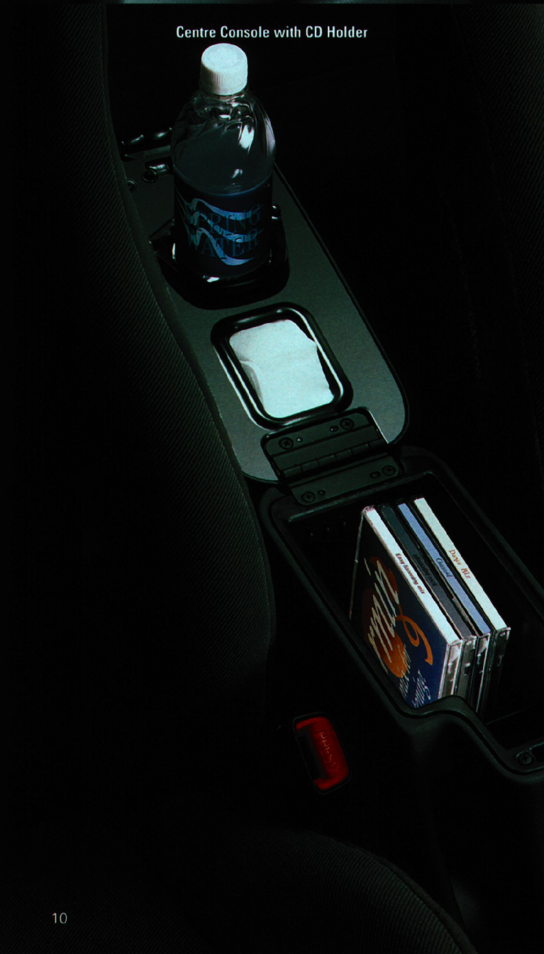
Centre Console with CD Holder